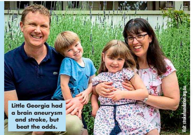
Little Georgia had a brain aneurysm and stroke, but beat the odds.

undeterred and started teaching Georgia sign language, devoting themselves to their daughter’s rehabilitation through physiotherapy, occupational therapy and speech therapy.