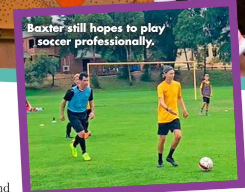
Baxter still hopes to play soccer professionally.