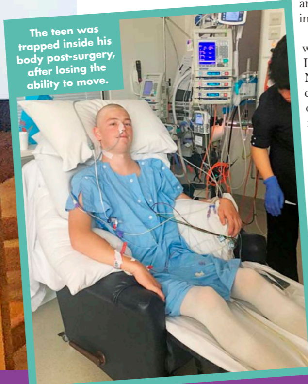
The teen was trapped inside his body post-surgery, after losing the ability to move.