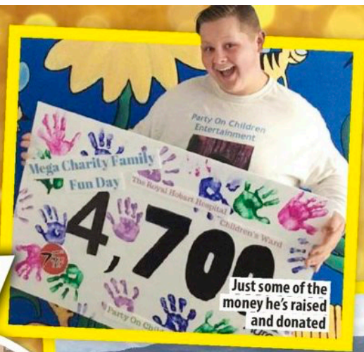
Just some of the money he's raised and donated