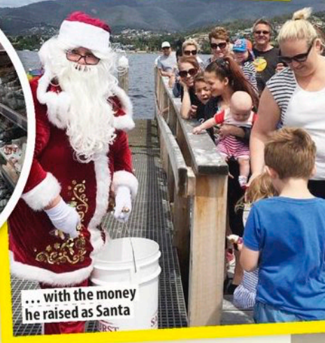
... with the money he raised as Santa

One day he came home from school beaming with excitement. He'd signed up to participate in the Mr/Miss Diamond Beauty Pageant, which had no age, height or weight criteria.